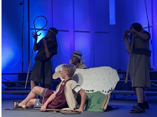
2 - Grade 7 and 8