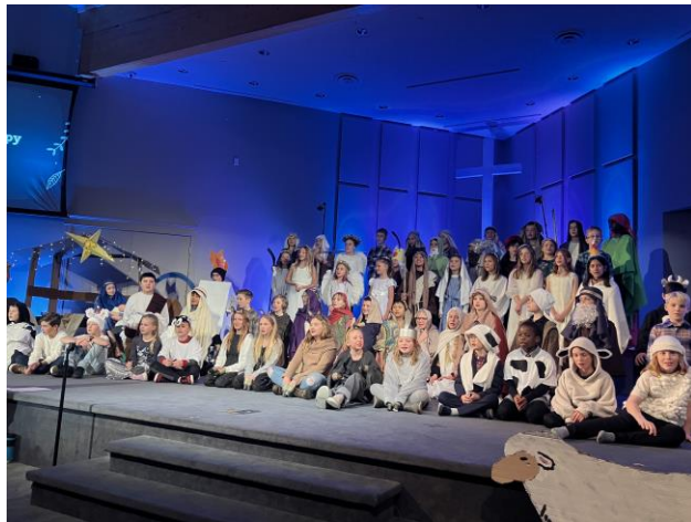
9 - Grade 5 and 5/6