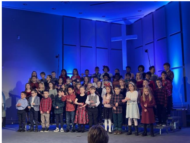
6 - Grade 2