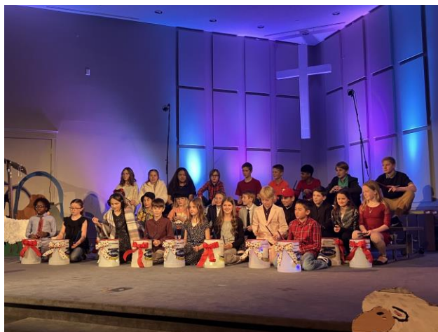
10 - Grade 6