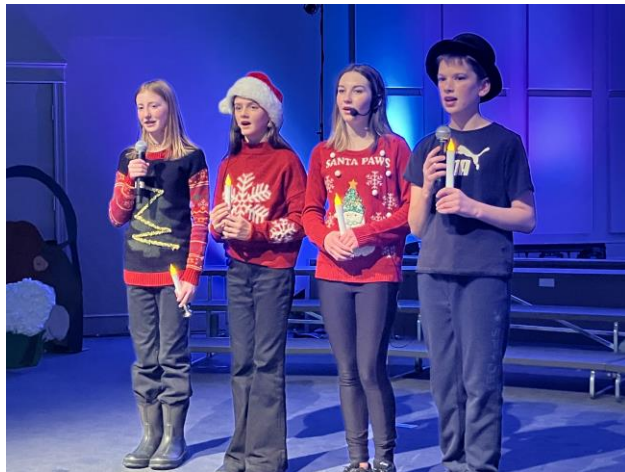
3 - Grade 7 and 8