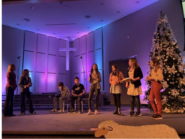
11 - Grade 7