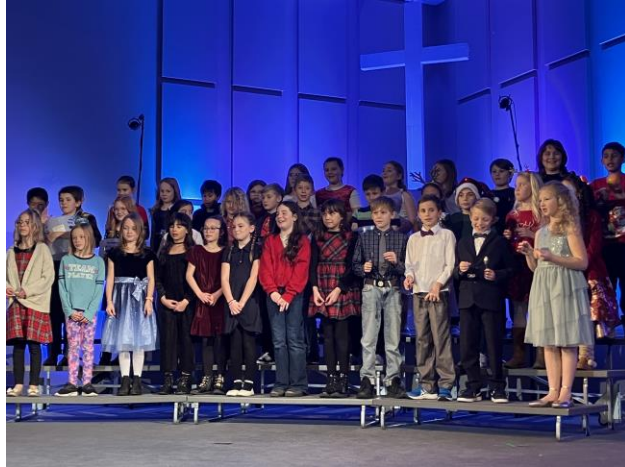
8 - Grade 4