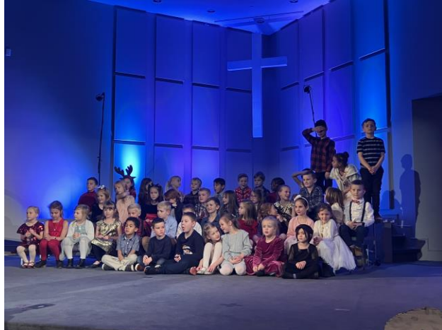
5 - Grade 1