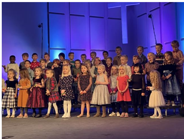
4 - Kindergarten