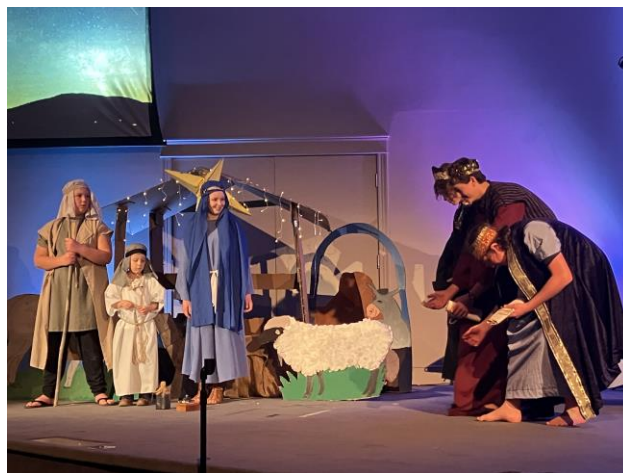
1 - Grade 7 and 8