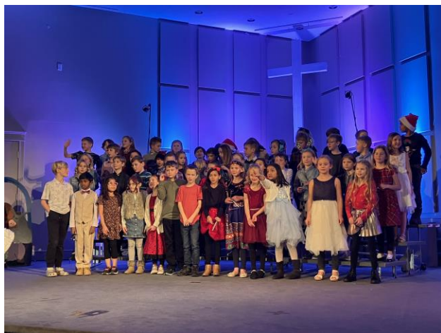
7 - Grade 3